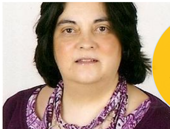
Gabriela Lima Agrarian School